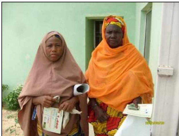
Two women holding the seed vouchers and the posters. They heard about the seed fair on the radio

Everybody was excited and waited to be certain that his or her name was on the list. Only a few women participated in the seed fair. When two of the women were asked how they got the information about the seed fair, they said that they had heard the jingles on the radio and that the town of Bunkure was mentioned. This made them curious and they had to ask their husbands to give them more information about the fair. The husbands obliged and thus the women were able to participate.