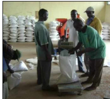
Repackaging seeds into 12 kg bags took a lot of time. Even management helped

The hustle and bustle to supply the seed began. According to the project, rice seed was to be produced during the dry season. However, because of the late start of the project, that was not possible and SARI had to look for certified seed from the private sector. An emergency meeting was organized, inviting all stakeholders of the seed industry across the three northern regions. While the Seed Producers' Association of Ghana (SEEDPAG), Northern Region Chapter could provide some seeds for two of the three selected varieties, the others could not provide any seed. At the end of the day, SARI had to fall back on its Farm Management Unit that normally produces foundation seeds to make up for the difference.