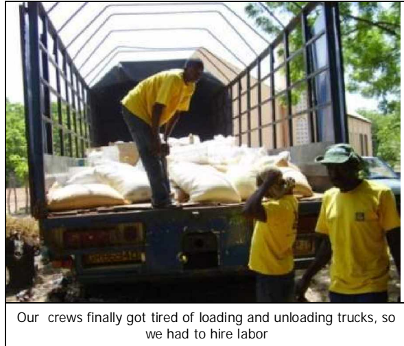
Our crews finally got tired of loading and unloading trucks, so we had to hire labor

Then we distributed seed across the three northern regions, since SEEDPAG could not do it. The institute's 22-year old truck had to be refurbished and commandeered to haul the seeds to the districts. The drudgery of loading and off-loading the seeds became unbearable for the crew and so we hired labor. From the districts, the selected agro-input dealers took over the baton to distribute the seeds to the communities. Distribution took more than two months which contributed to the delay of seed supply to some of the communities. The joy of it all was that at the end of the day, all targeted farmers got seeds for the smooth take-off of the project. Certainly, most of these challenges will be alleviated in the second year of the project by taking a cue from the first year.